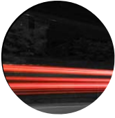
BUSINESS: Alburgh Dollar General in works