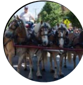
Hot day for the Dairy Festival parade