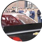
No. 88 car in St. Albans