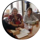
COMMUNITY: Room at the table