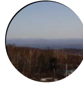
Blue sky, blue lake